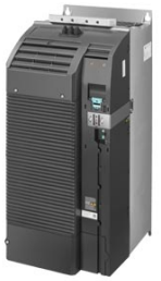
图像类似 / Figure similar