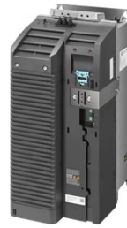
图像类似 / Figure similar