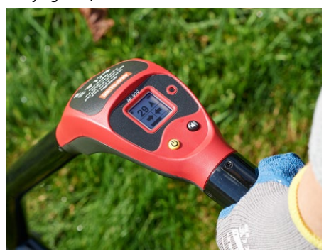
Clearly view the LCD display in bright sunlight