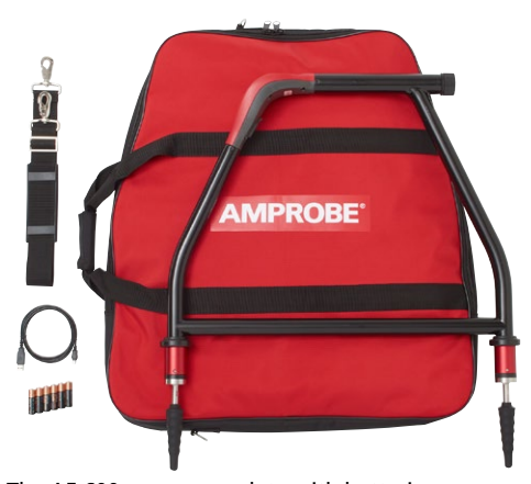
The AF-600 comes complete with batteries and a carrying case