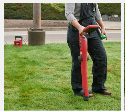
Trace an individual utility by connecting the transmitter directly with the test leads