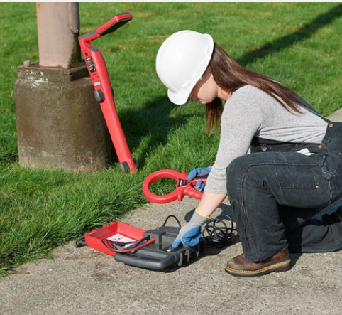
The Transmitter will automatically change modes based on which accessory is plugged in