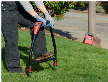
Pinpoint fault location by using the AF-600 with the UAT-600 Transmitter