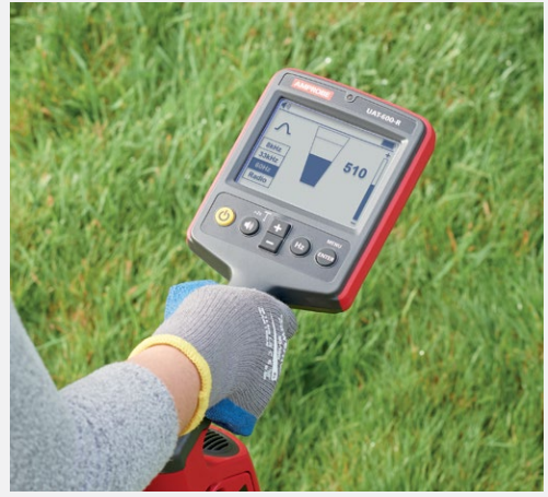
The Receiver's high contrast LED screen is easy to read in full sunlight