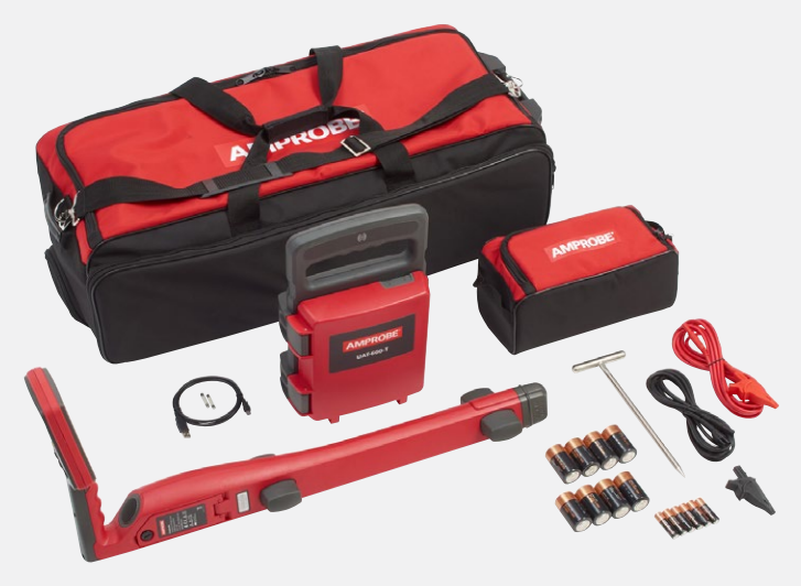
UAT-610 Underground Utilities Locator Kit