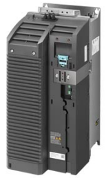
图像类似 / Figure similar