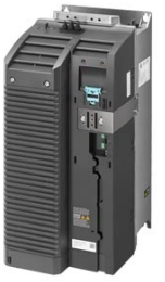
图像类似 / Figure similar